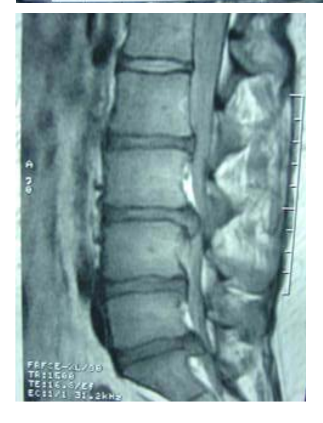
Figure 4: This sagittal MRI shows the L3-4 and L5-S1 disc herniations that contact the thecal sac to create stenosis and cauda equina compression. Note carefully the indentation of the cauda equina by these disc herniations and fragments.