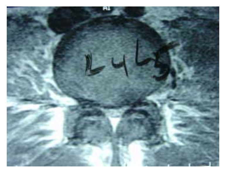
Figure 2: Here is the L4-5 axial image. As in Figure 1, the congenitally short pedicles create vertebral canal and foraminal stenosis. Note the small area for the cauda equina and the broad based L4-5 disc bulge that markedly narrows the sagittal diameter of the vertebral canal. The lateral recesses and osseoligamentous canals are markedly narrowed and stenotic, creating nerve root and dorsal root ganglion compression.