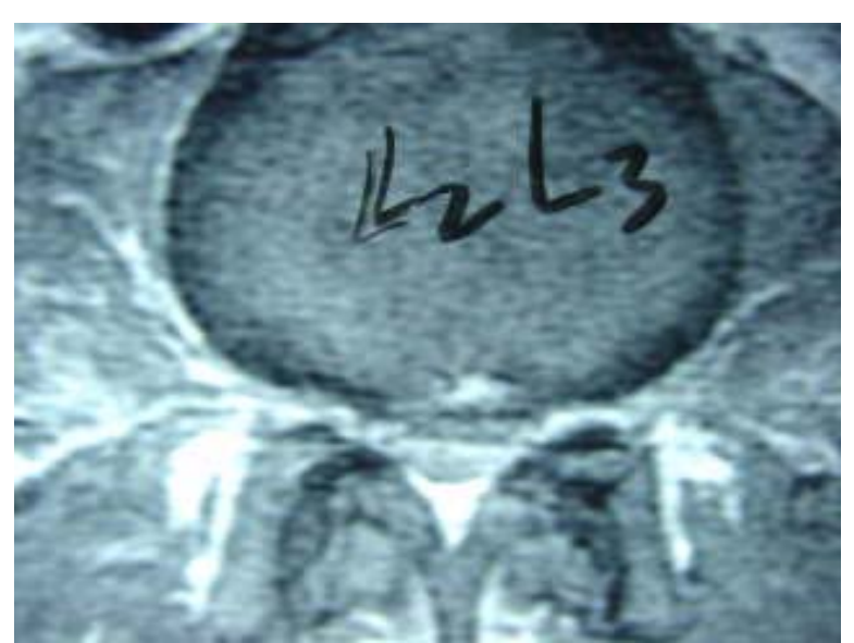
Figure 5: Here is the L2-3 disc level showing a central disc protrusion that contacts and displaces the thecal sac posteriorly. A high intensity zone is present in the central posterior disc space.