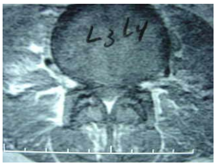
Figure 1: Here is the L3-4 axial image showing bilateral foraminal stenosis due to underdeveloped pedicles. Note the stenotic vertebral canal housing the cauda equina.